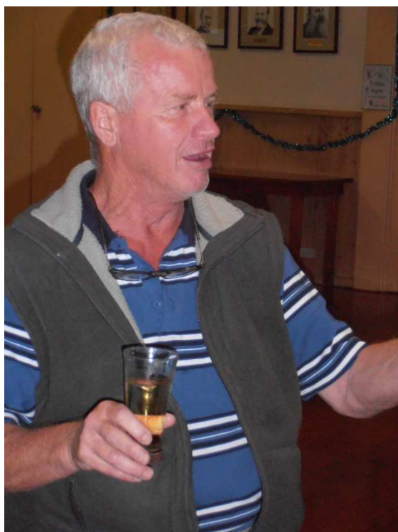
Photo: Case extolling the virtues of his astute tipping to anyone who cares to listen!